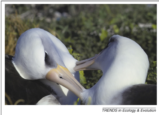
Figure 1. A female pair of Laysan albatross Phoebastria immutabilis .

Although alternative reproductive strategies are known to occur in females, the phenomenon is usually associated with smaller or younger males that act as satellites or otherwise ‘sneak’ copulations that would ordinarily be obtained by territorial or dominant males [5]. Often the males pursuing such strategies have no other alternative, perhaps because of insufficient nutrition [5]. The albatross can be seen to be similarly ‘making the best of a bad job,’ because their reproductive success, although obviously higher than if they had simply not bred at all, was lower than that of mixed-sex pairs.